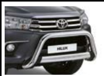
Stainless steel nudge bar

Various accessories are available. Please consult your Toyota dealership for details.