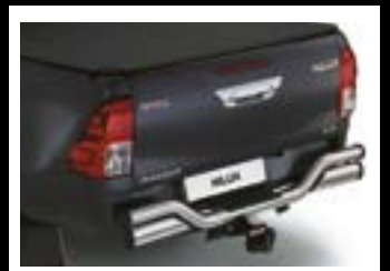
Stainless steel rear step

Specifications may vary from models shown. Please contact your Toyota dealership for more informations.