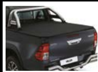
Stainless steel styling bar