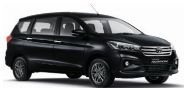
ZAM - PRL. MIDNIGHT BLACK