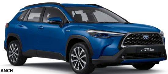
8X2 - Nebula Blue ME.