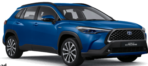
8X2 - Nebula Blue ME.