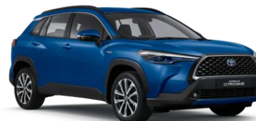
8X2 - Nebula Blue ME.